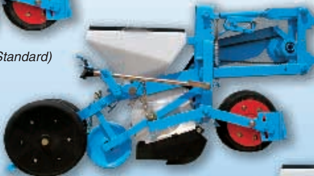
MECA V4 Balancing system