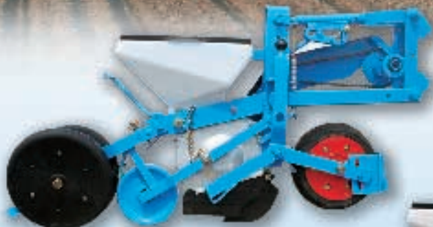
MECA V4 Front gauge wheel (Standard)