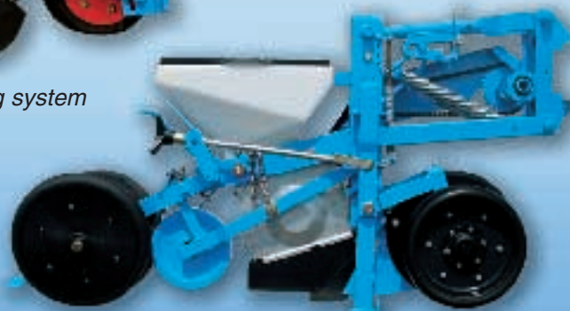
MECA V4 Double discs